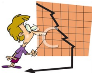
Financial Crisis Report