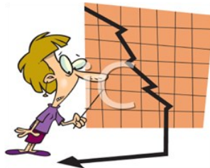
Financial Crisis Report